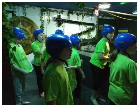
Everything from archery to piranha pools! Robinwood