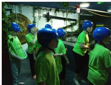
Everything from archery to piranha pools! Robinwood