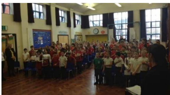
St David's Day Eisteddfod

Although the language of the school is English, Welsh is taught as an additional language to all pupils. Everyday language is encouraged throughout the school and monitored by members of our Criw Cymraeg. We strive to ensure a Welsh ethos is well-established within our school, both in and out of the classroom. Studies of Welsh artists, poets and authors take place in all classes, as well as learning about Welsh culture and heritage in areas across the curriculum.